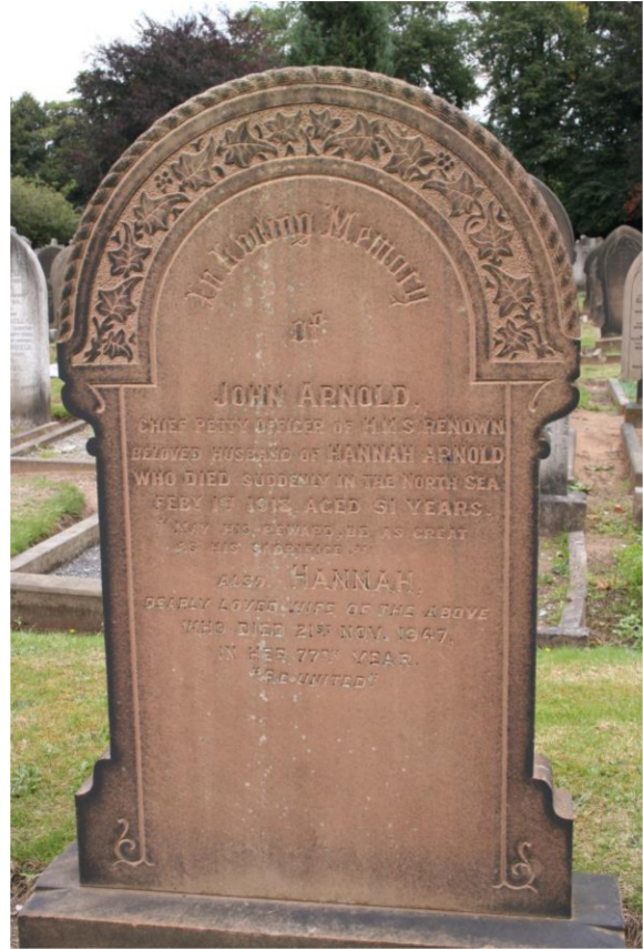
John's Grave in Altrincham (Hale) Cemetery